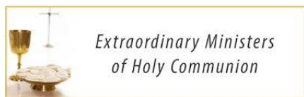
Extraordinary Ministers of Holy Communion

EXTRAORDINARY MINISTERS OF HOLY COMMUNION (EMHC): WOLVERHAMPTON DEANERY LENTEN GATHERINGS Monday 23 rd March, 6.30pm at St. Joseph's, Willenhall Road (WV1 2QN), and Saturday 28 th March at 12noon at St Michael's, Colway Road (WV3 7ND). All EMHCs who